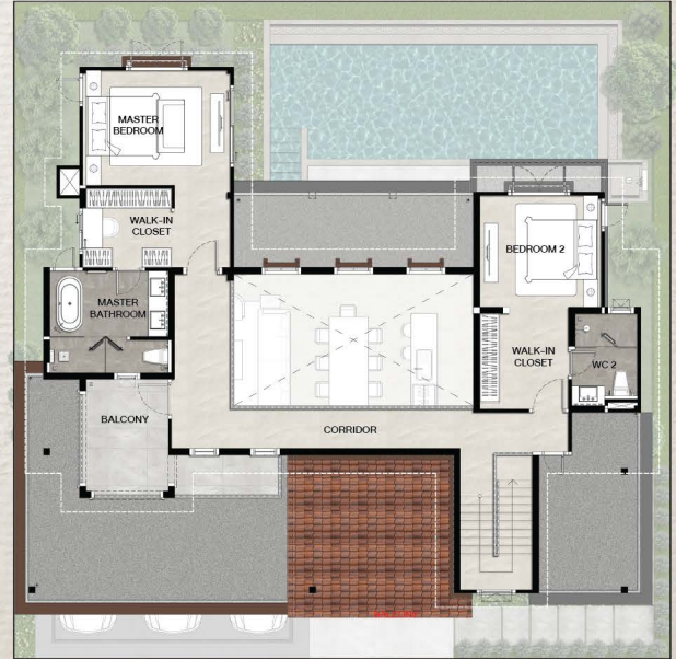
2 nd Floor Plan