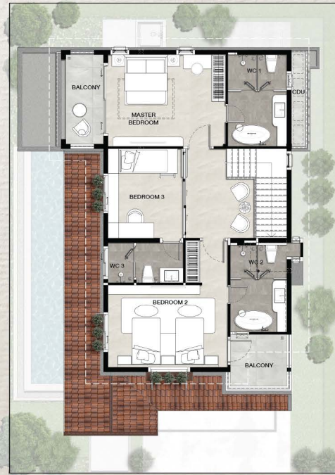
2 nd Floor Plan